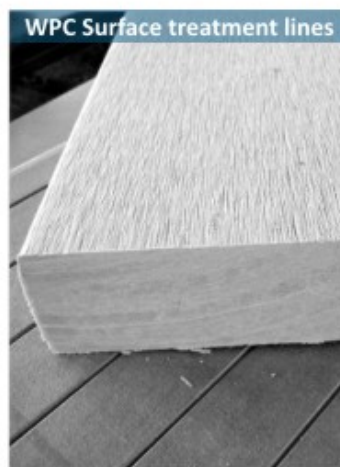
Embossing Sanding CNC routing Vacuum lamination Printing & UV Coating Brushing Transfer printing