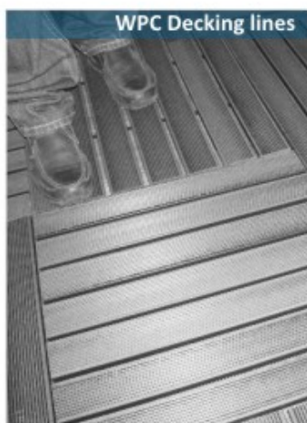
WPC Flooring lines WPC Wall cladding lines WPC Pallet lines WPC Moulding strip lines WPC lumber lines WPC Door frame lines