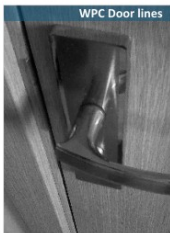
WPC Door lines WPC Hollow door lines WPC Flush door lines